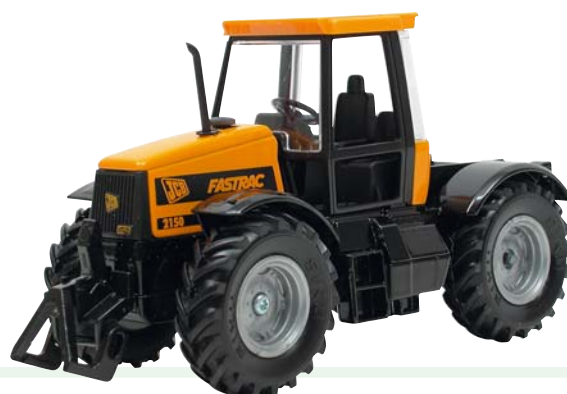
JCB FASTRAC 2150 FA113160