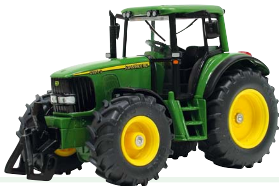
JOHN DEERE 6920 S FA113252