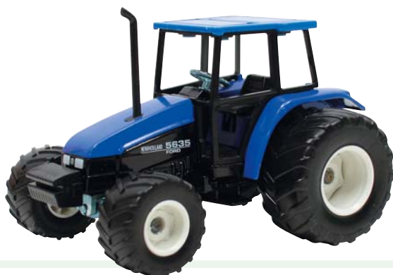
FORD NH 5635 FA112652