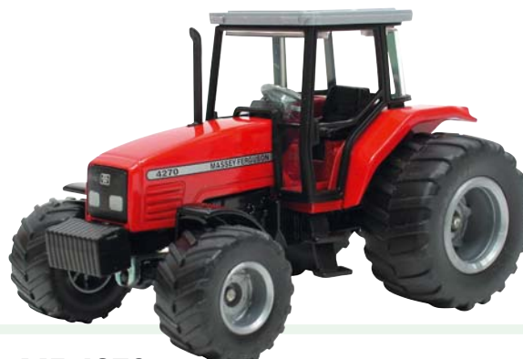
MF 4270 FA112654