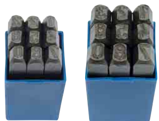
FIGURE STAMP SET 9-pcs HD