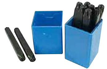
FIGURE STAMP SET